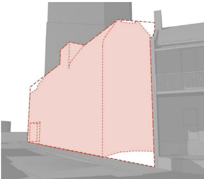
Figure 3: Reference scheme perspective as viewed from Nimrod Street looking northeast