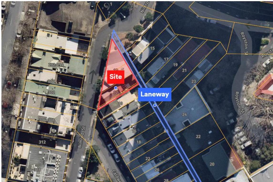
Figure 1: An aerial image of the subject site and immediate vicinity